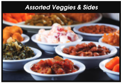
Assorted Veggies & Sides