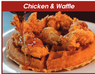
Chicken & Waffle