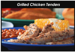
Grilled Chicken Tenders