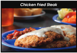
Chicken Fried Steak